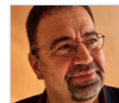
Daron Acemoglu MIT