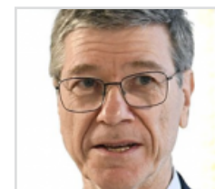
Jeffrey Sachs Columbia University