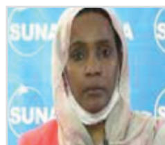
Sara Hassanain Former Acting Minister of Health