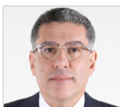
Karim El Aynaoui Mohammed VI Polytechnic U.