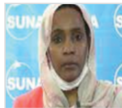
Sara Hassanain Former Acting Minister of Health