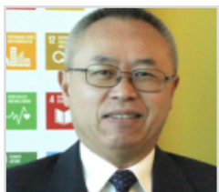
Li Junhua United Nations