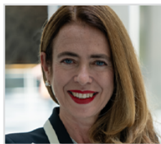
Roberta Gatti The World Bank