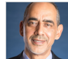
Tarik Yousef Middle East Council