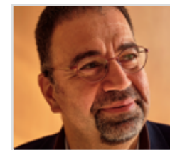
Daron Acemoglu MIT