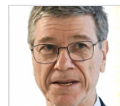
Jeffrey Sachs Columbia University