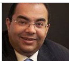
Mahmoud Mohieldin United Nations