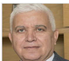
Abderrahim Bouazza Bank Al Maghrib