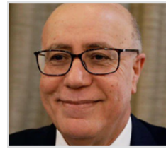
Marouane El Abassi

Former Governor, Central Bank of Tunisia