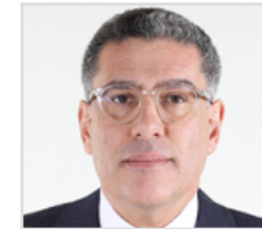
Karim El Aynaoui

Former Governor, Central Bank of Tunisia