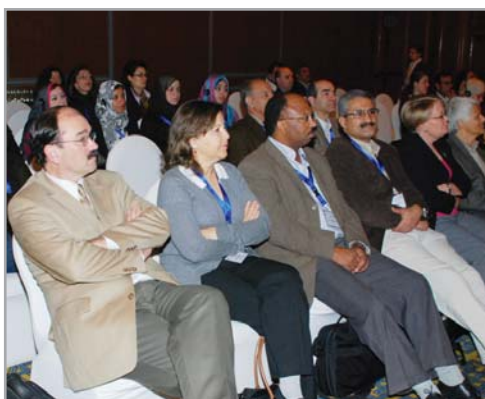
A plenary session at the ERF 15 th Annual Conference.