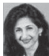
Nemat Shafik Department For International Development (DFID), United Kingdom