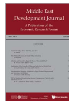
Table 3. ERF Publications, 2008-2009