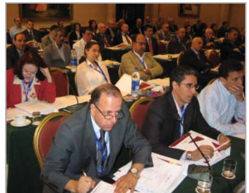
Financing Higher Education Regional Conference. A thematic session.