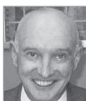
Lyn Squire Economic Research Forum