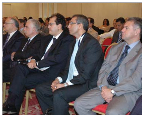
Monetary Policy Seminar. A thematic session.