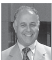
Mustapha Nabli The World Bank, USA